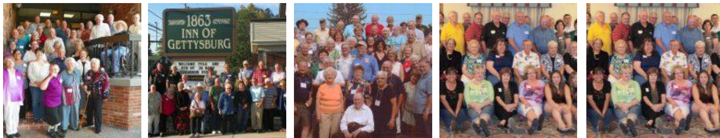
Photographs from past Gatherings

Included at the Gathering is the election of Board of Directors whose terms are due to expire or are vacant. The Gathering will also include a time for 'Show & Share', that gives opportunities for attendees to give a brief presentation that may include a family story or showing an item of interest.